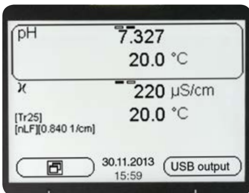
Display with two measured values