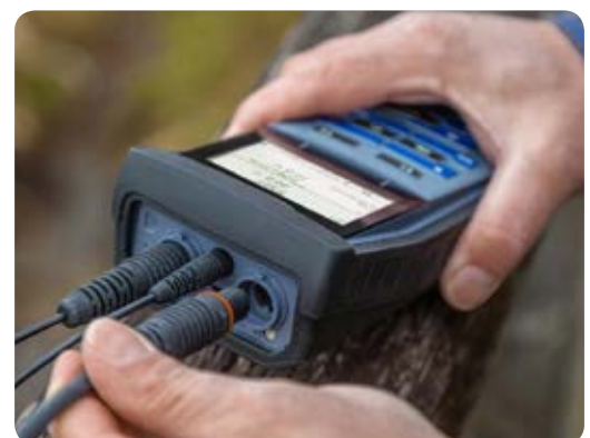
With waterproof mini USB-B interface for up-to-date data transfer.