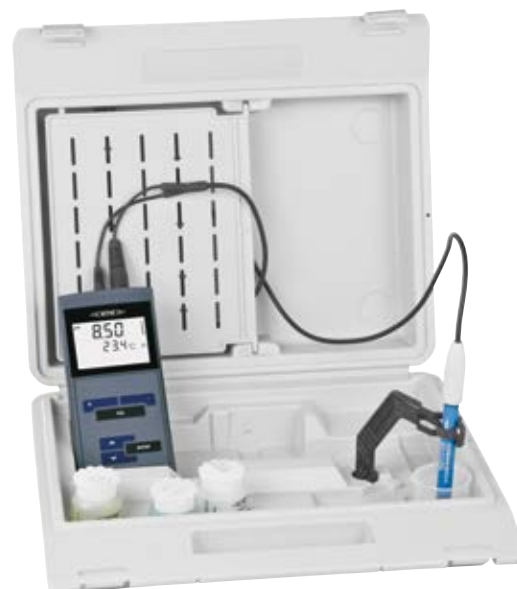
Set in case

For more detailed information please order free of charge our catalog "Lab and Field Instrumentation" or visit our web site : www.wtw.de/en/produkte/labor (For convenience use our QR code).