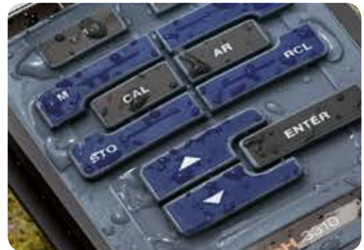
Robust sealed silicone keypad - 100% waterproof