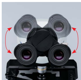
Eyepoint height adjustment