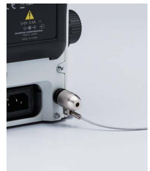
Built-in security slot