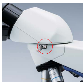
Locking pin for easy binocular rotation