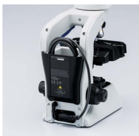
Convenient and easy access power cable storage