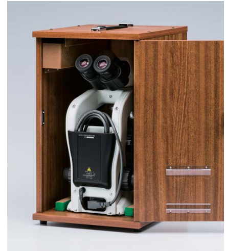
Dedicated wooden case (optional)