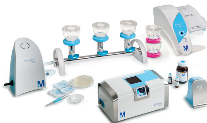
Figure 3. The EZ-Products Family.