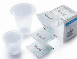
Figure 2. Sterilized Microfil® Funnels with EZ-Pak® Membranes.

Merck KGaA Frankfurter Strasse 250 64293 Darmstadt Germany