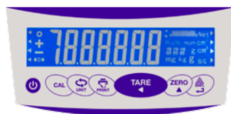
Keypad and display