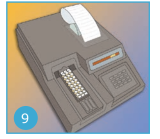
Read wells with a microwell reader using a 450 nm filter.