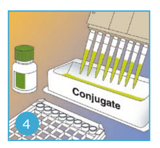
Add conjugate solution to the wells and incubate for 20 min.