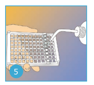
Discard contents from the wells and wash with wash buffer.