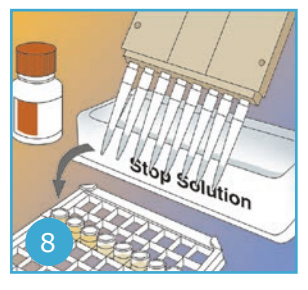
Add stop solution to each well.