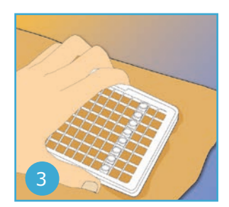
Tap to dry the plate.