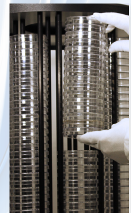
PS400 dish loading