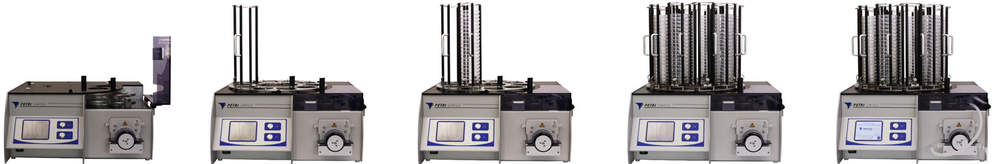
PS200 sequential process