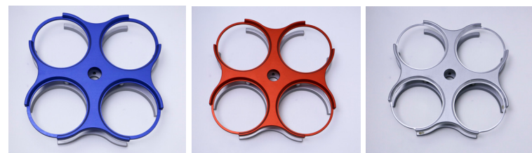
3 different separators