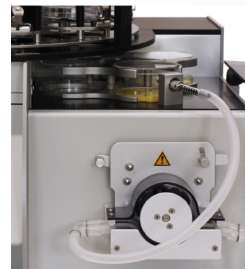
PS200 Pump head and filling chamber