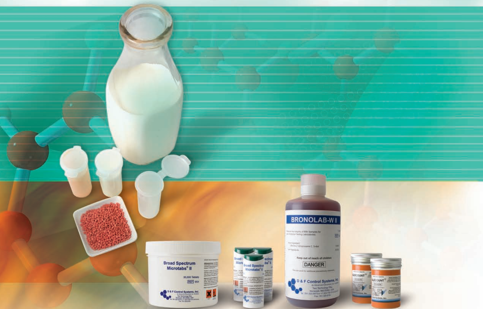
Broad Spectrum Microtabs® II tub containing 35,000 tablets

D & F Control Systems is a global leader in providing safe, simple, and cost-effective milk preservatives and fluorescent staining dyes supporting thousands of milk testing and dairy herd improvement laboratories worldwide. We deliver value to dairy farmers and testing laboratories by manufacturing trusted, reliable products that ensure consistent, accurate analytical test results for somatic cell count and component analysis.