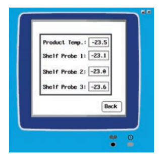
LyoQuest control panel screens

Based on more than 40 years of experience, Telstar introduces the LyoQuest as state of the art in performance and process control. The unit was specifically developed for basic research in biotechnology and scientific institutes.