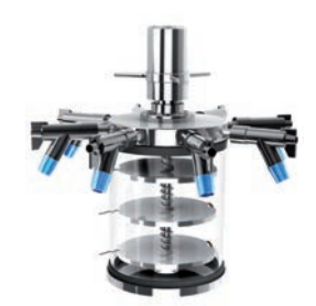
Standard stoppering chamber with 8 port manifold